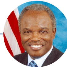
Rep. David Scott, GA Chair, H. Ag Committee