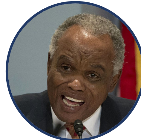
Chairman David Scott (D-GA)