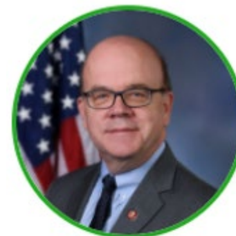
REP. JIM MCGOVERN