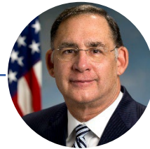
Sen. John Boozman, AR Ranking Member, S. Ag Committee