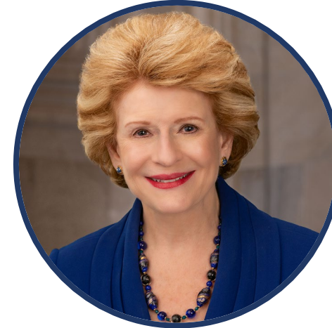
Chairwoman Debbie Stabenow (D-MI)