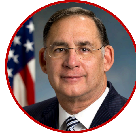
Ranking Member John Boozman (R-AR)