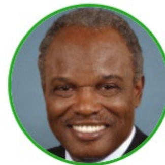
REP. DAVID SCOTT