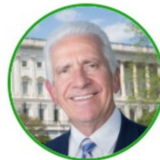
REP. JIM COSTA