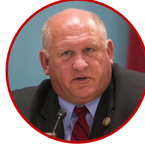
Ranking Member G.T. Thompson (R-PA)