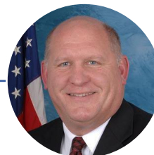
Rep. "GT" Thompson, PA Ranking Member, H. Ag Committee