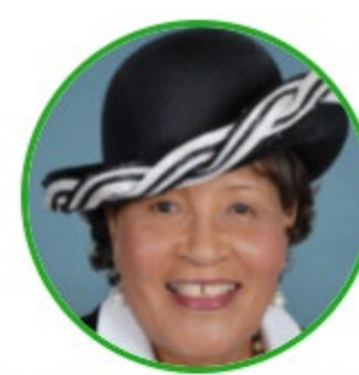
REP. ALMA ADAMS