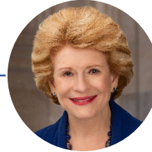
Sen. Debbie Stabenow, MI Chair, S. Ag Committee